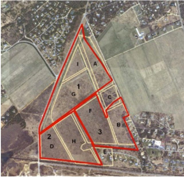
Figure 2. The red outlined areas are the three large management units established in 2000. Smaller yellow units were established in the 1980s.

In 2000, The Nature Conservancy developed a management plan to apply prescribed fire and mowing during the same year. Specifically, they burned in spring (March to May) and mowed in summer (mid-August to fall) on a three-year rotation for six years among three large management units. A similar management regime is continued today. Prescribed fire applied every three to four years, and mowing every six years per unit. The interval of repeated management was selected to keep shrubs below 1.5 m height. A "control" unit is also mowed when shrubs are above 2 m tall. Pitch pines ( Pinus rigida ) are selectively cut when they appear, including in the control unit (Revised Management for Katama 2000).