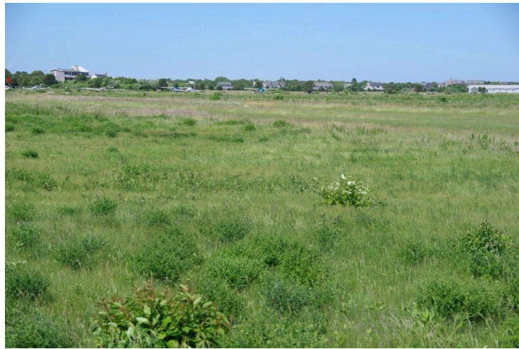
Figure 1. Katama Plains landscape.

Prior to European settlement, this area likely had primarily low oak and pine woodland similar to other uncultivated areas of Martha's Vineyard. Since the mid-1600s this area was used as pasture for sheep and cattle with occasional burning for management and grazed regularly up until the 1900s. Based on soil horizons there was likely soil tilling for crop agriculture before 1900, but the land has been protected since then. Aerial images and records show that Katama Airfield has been grassland since the 1920s and likely even earlier. In 1938 aerial photos, the Katama property was continuous grassland. Regular burning for management was implemented up until 1962. In 1988 the Department of Environmental Management acquired parts of Katama Plains and more recently the property has been managed with a combination of mowing and burning.