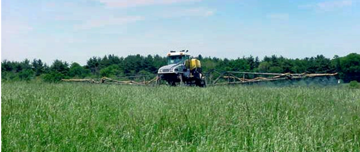
Figure 4. An example boom-broadcast of herbicide for conversion from agricultural lands to exclude perennial grasses.

One of the most localized methods for herbicide application is mechanical cutting and painting of herbicide on stems. In addition, foliar spray can be applied with equipment that sprays individual plants (Drew Vitz, Interview). Such targeted application methods reduce the impacts of herbicide on other plants or animals (J. McCumber, Interview). The weather conditions when herbicides are applied should be carefully considered (Raleigh et al. 2003).