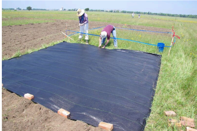
Figure 1. Invasive grass removal using plastic covering at the Bamford Preserve, Martha's Vineyard.

Vegetation removal activities in sandplain grassland typically aim to promote a diverse assemblage of target grassland species with a high proportion of warm-season grasses and native forbs, and a low proportion of cool season grasses and nonnative invasive species through the removal of undesirable species. In existing grassland, undesirable species include nonnative and aggressive native and non-native woody plants. Vegetation removal can be mechanical such as hand-pulling, digging, cutting, select mowing, or shading (Fig. 1). It can be by chemical treatment with herbicides, or by a combination of mechanical and chemical methods. The most commonly used and effective method is direct herbicide application to undesirable species. Recent experience shows that this can be an effective, targeted tool to remove unwanted plants from existing sandplain grasslands.