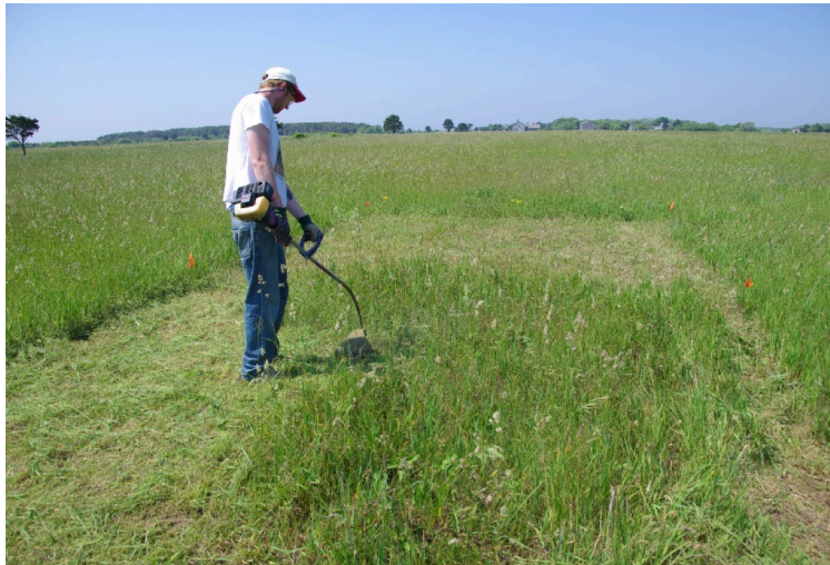
Figure 3. Mechanical cutting of experimental plots in an agricultural grassland dominated by cool-season, European grasses at the Bamford Preserve on Martha's Vineyard.

Application of herbicides alone in existing sandplain grasslands should be restricted to spot treatments of problematic species rather than widespread treatments, and should be used in conjunction with other standard grassland maintenance techniques such as mowing and prescribed fire (TTOR 2009). When used together, the total amount of herbicide applied can be